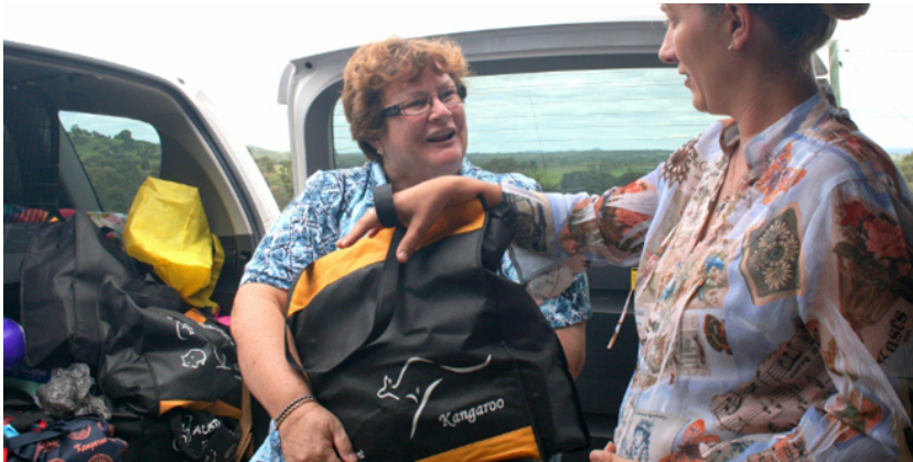
Practical ministry: A rural resident receives help from Downs & West Community Support.