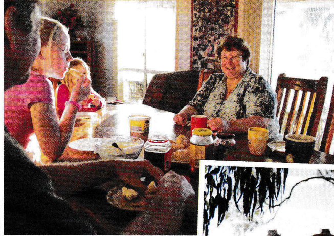
GOING BUSH Sometimes just a visit or a chat over a cuppa is all these families need to feel supported